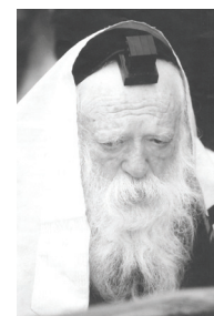
R. Chayim Kanievsky