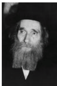
R. Aharon Yehuda Leib Shteinman