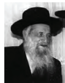
R. Shmuel HaLevi Wosner

When the Chazon Ish, zatzal , spoke to me about this matter, I showed him that the Chasam Sofer, zy'a , already [wrote about this halachic principle] and it was thus obvious to him that [shaving machines] are prohibited, as I explained, with G-d's help, in a responsa.